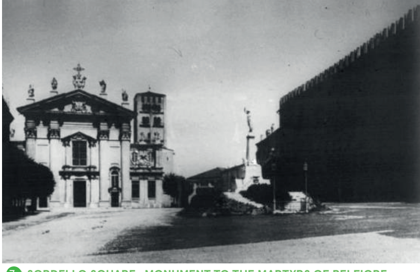
O SORDELLO SQUARE- MONUMENT TO THE MARTYRS OF BELFIORE, 1887/1899

The photo was taken from the "Te" island. The Fossa Magistrale, filled in 1930, lowed in what is now Risorgimento Street . Once the walls and the gate were oulled down, only Palazzo San Sebastiano was left.