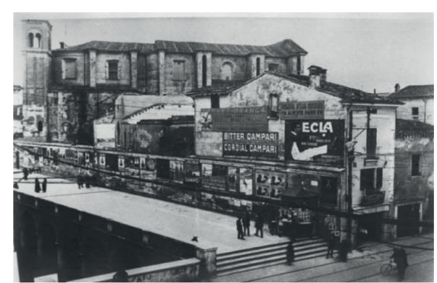
3 LUNGORIO – CHIESA DI SAN DOMENICO, 1925

Ponte San Giorgio" was built after the Second World War using the supporting ructure of the previous bridge. In front of the castle there stood the "Palazzina ella Paleologa", which was demolished in 1898, and on the left of the bridge ere was a small chapel dedicated to San Giovanni Nepomuceno.