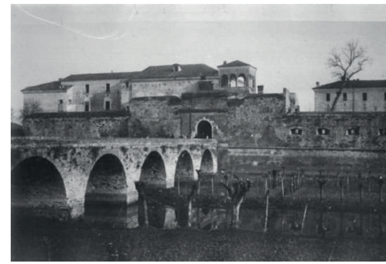
8 MANTOVA-PORTA PUSTERLA-PALAZZO DI S. SEBASTIANO- FOSSA MAGISTRALE-1905

Corso Libertà was built only in the 50s; in its place, the Rio once flowed, overlooked by houses, before becoming an underground canal. In this photo we can see the post office building on the right and on the bridge the statue of San ilvestro, which stands now on the opposite side of the square.