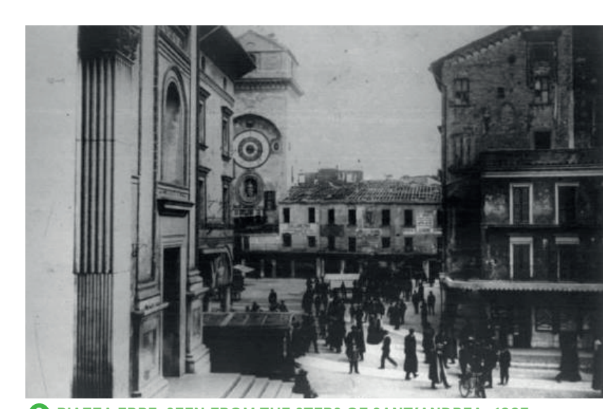
9 PIAZZA ERBE SEEN FROM THE STEPS OF SANT'ANDREA, 1907.

n the centre of the square there was a monument dedicated to the Martyrs of elfiore, which was placed there in 1872; in 1930 the sarcophagus containing the elics was moved to the Church of San Sebastiano, where it is still kept. Instead, he statue representing the Genius of Mankind by Miglioretti can now be seen at the entrance of Belfiore Park, where it was relocated in 2002.