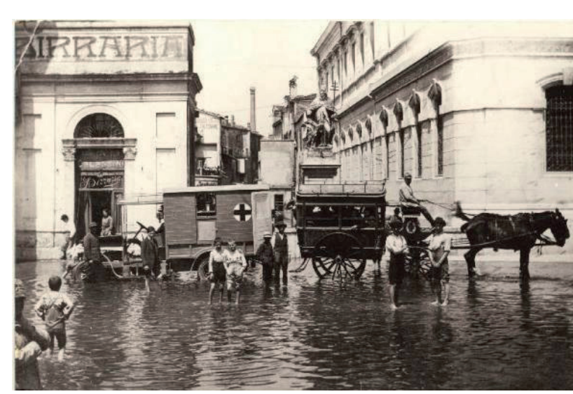
6 PIAZZA "MARTIRI DI BELFIORE" – A RED CROSS AMBULANCE AND A CARRIAGE DURING THE FLOOD- 1917

Corso Libertà was built only in the 50s; in its place, the Rio once flowed, overlooked by houses, before becoming an underground canal. In this photo we can see the post office building on the right and on the bridge the statue of San ilvestro, which stands now on the opposite side of the square.